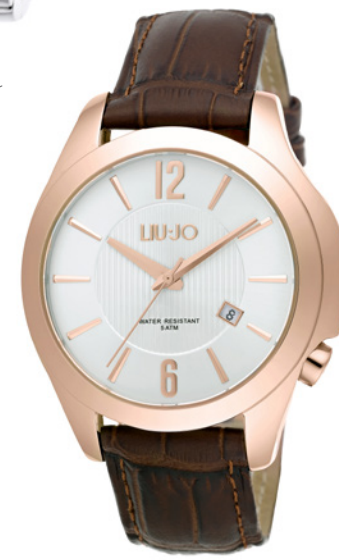
TLJ 962 D: Silver S: Marrone / Brown 179,00 €