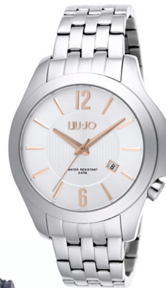
TLJ 964 Total Silver 179,00 €