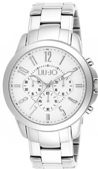
TLJ 827 Total Silver 159,00 €

BAND: in stainless steel, stainless steel clasp with external logo.