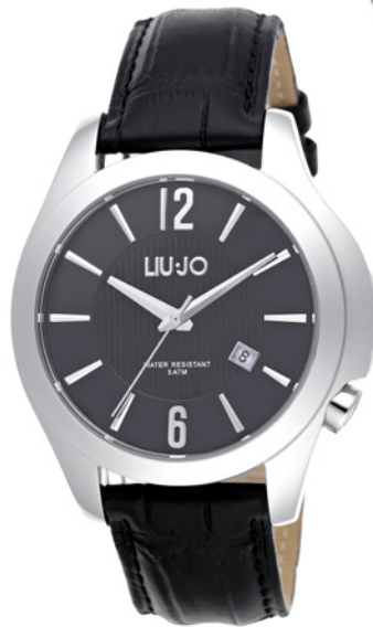
TLJ 960 Total Black 169,00 €