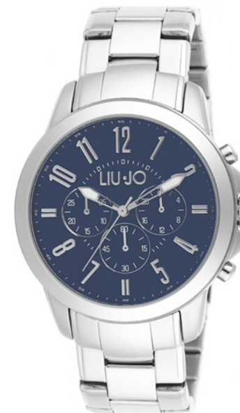
TLJ 829 D: Blu / Blue B: Silver 159,00 €