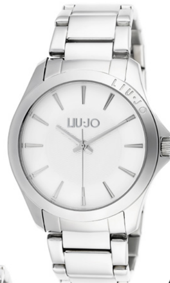
TLJ 811 D: Bianco / White B: Silver 129,00 €