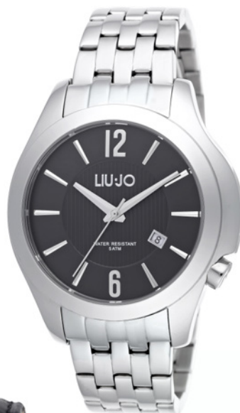
TLJ 963 D: Nero / Black B: Silver 179,00 €

STRAP: in leather, stainless steel buckle with engraved logo.