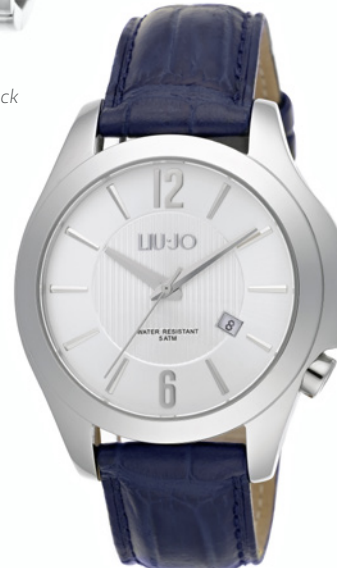
TLJ 961 D: Silver S: Blu / Blue 169,00 €