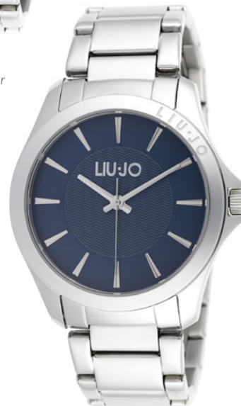
TLJ 813 D: Blu / Blue B: Silver 129,00 €