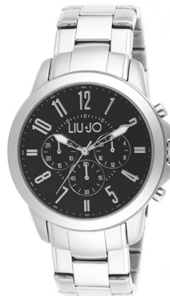
TLJ 828 D: Nero / Black B: Silver 159,00 €