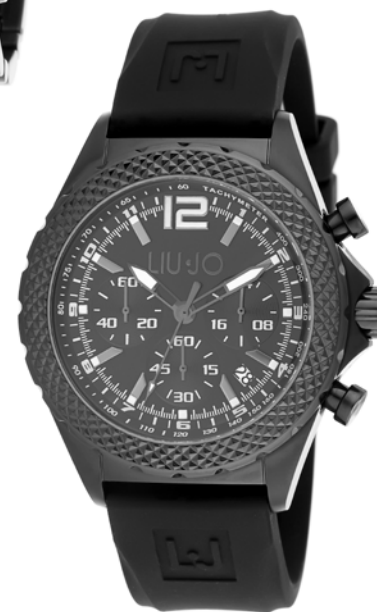
TLJ 832 Total Black 209,00 €