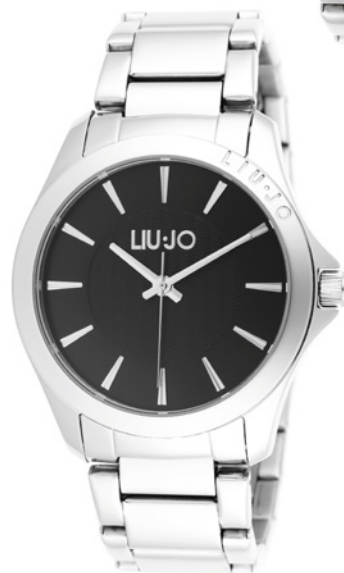
TLJ 812 D: Nero / Black B: Silver 129,00 €