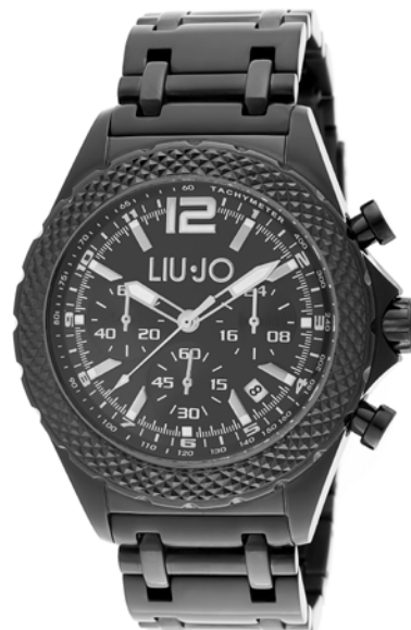
TLJ 835 Total Black 259,00 €