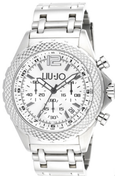
TLJ 833 D: Silver Bianco / Silver White B: Silver 239,00 €

STRAP: in silicone with Liu-Jo logo and stainless steel buckle with Liu-Jo laser engraved logo.