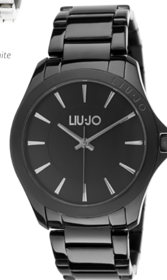
TLJ 814 Total Black 139,00 €