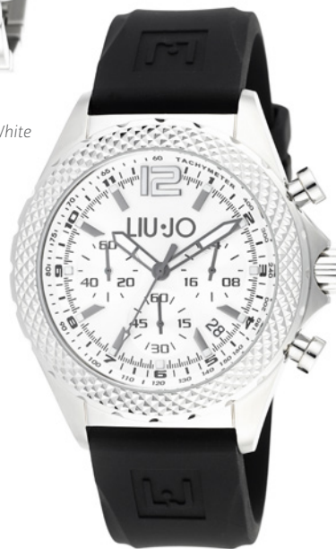
TLJ 830 D: Silver Bianco / Silver White S: Nero / Black 199,00 €