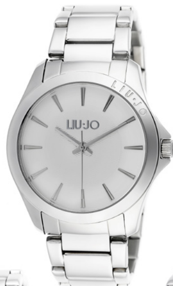
TLJ 958 Total Silver 129,00 €

BAND: adjustable shiny stainless steel band, stainless steel clasp with external laser logo.